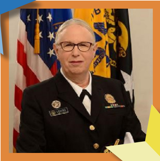
Admiral Rachel L. Levine, MD

Admiral Rachel L. Levine serves as the 17th Assistant Secretary for Health for the U.S. Department of Health and Human Services (HHS) and the head of the U.S. Public Health Service Commissioned Corps. She fights every day to improve the health and well-being of all Americans. She's working to help our nation overcome the COVID-19 pandemic and build a stronger foundation for a healthier future - one in which every American can attain their full health potential. ADM Levine's storied career, first, as a physician in academic medicine, focused on the intersection between mental and physical health, treating children, adolescents, and young adults. Then as Pennsylvania's Physician General and later as Pennsylvania's Secretary of Health, she addressed COVID-19, the opioid crisis, behavioral health, and other public health challenges.